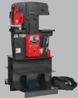
25 TON DUAL STATION

THIS POWERLINK SOURCE WILL POWER ALL OF THESE POWERLINK TOOLS