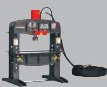
20 TON SHOP PRESS