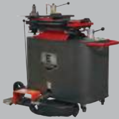
ROTARY DRAW BENDER