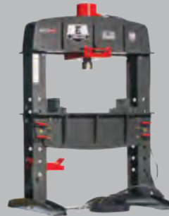
60 TON SHOP PRESS