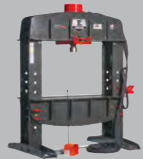
110 TON SHOP PRESS