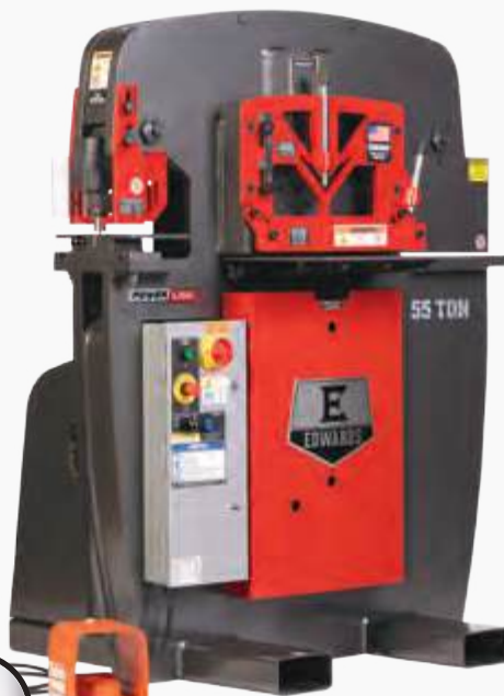
IW55-3P230-AC500 NOW STANDARD WITH LED LIGHTS