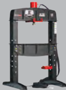
40 TON SHOP PRESS