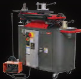
HPT2375 ROTARY DRAW BENDER PG 71