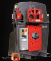
55 TON IRONWORKER PG 66