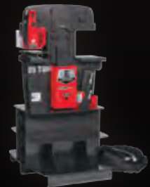
25 TON DUAL STATION PG 73