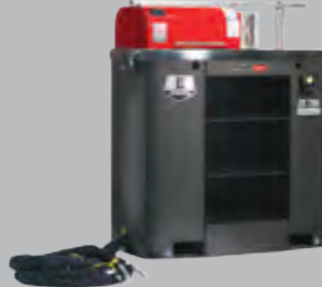
20 TON HORIZONTAL PRESS