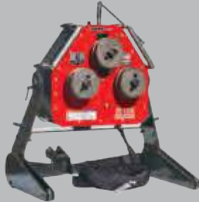
20 TON RADIUS ROLLER